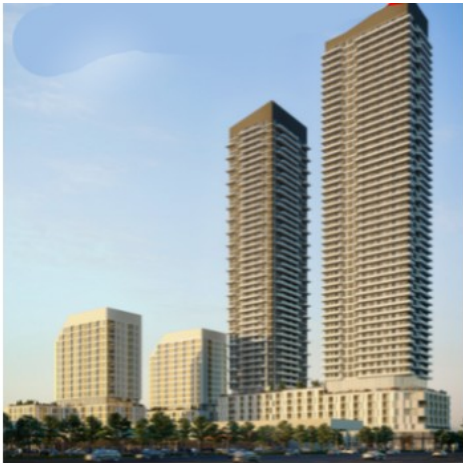
100 Steeles Ave. W.