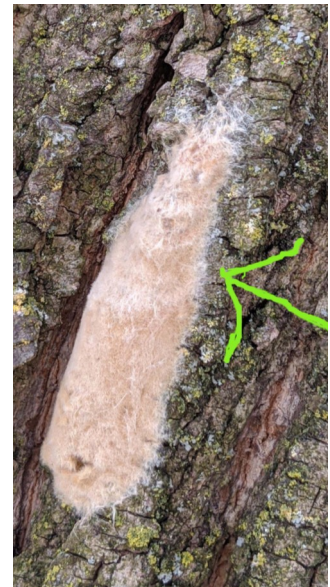
Gypsy Moth Egg Casing

After consultation with Markham forestry staff and the affected homeowners, he found and removed a total of 490 egg masses from 81 trees representing a potential of 150,000 gypsy moth caterpillars. This service was performed at no cost to the homeowner, to preserve and protect the health of the trees in our neighbourhood.