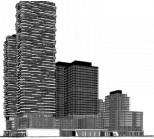
180 Steeles Ave. W.