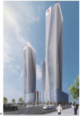
2 Steeles Ave. W.